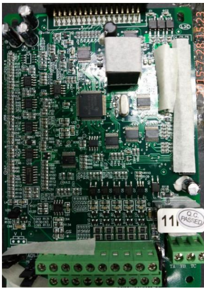
Controller board of AD800's