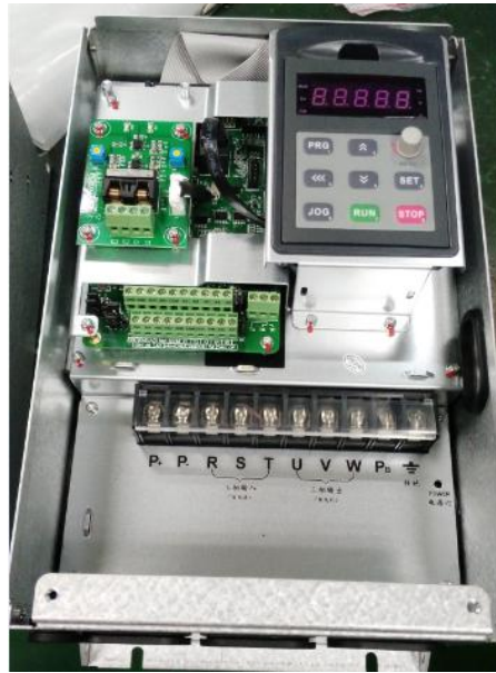
AD800 37kw VFD