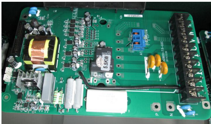
5.5kw power board of AD800's