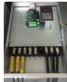
Electrical parts testing with automation fixtures. Every units of drive has tested with load before factory leaving

We promised offer No.1 quality of KEWO Drive with good quality components. High level brand IGBT, current sensor, and DSP... are good quality insurance.