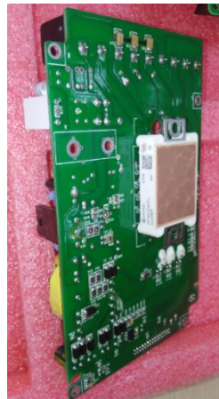
Infineon iGBT of AD350