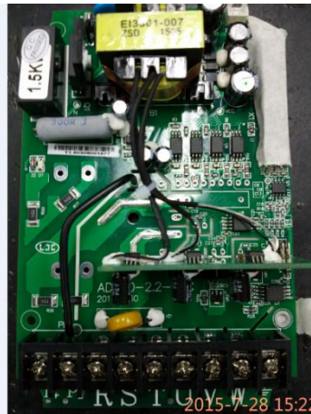
AD350 power board,