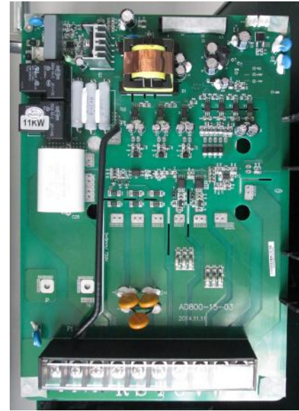
Power board of AD800, 7.5kw