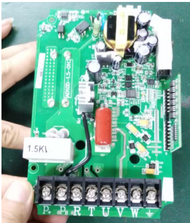
AD100 mini power board

Pictures of electrical parts and inside parts of Ac drives.